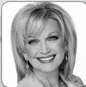
Stormie Omartian Author, The Power of a Praying Woman